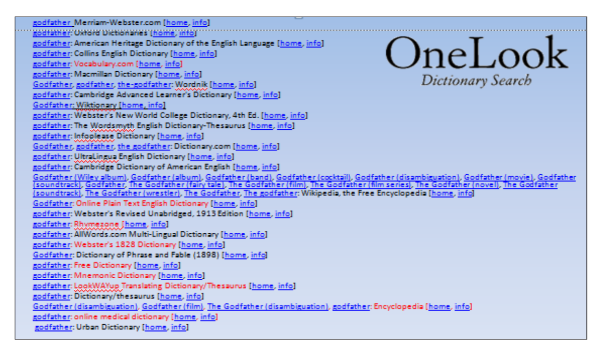
Fig. 3. One Look Dictionary Search Results on godfather lexeme

to the fact that the lexeme's future total loss of connection with Religious Discourse appears to be quite a presumable outcome.